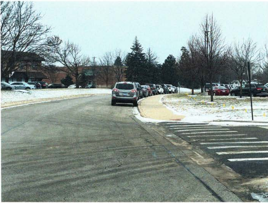
12/22/2022 Trackout on public road