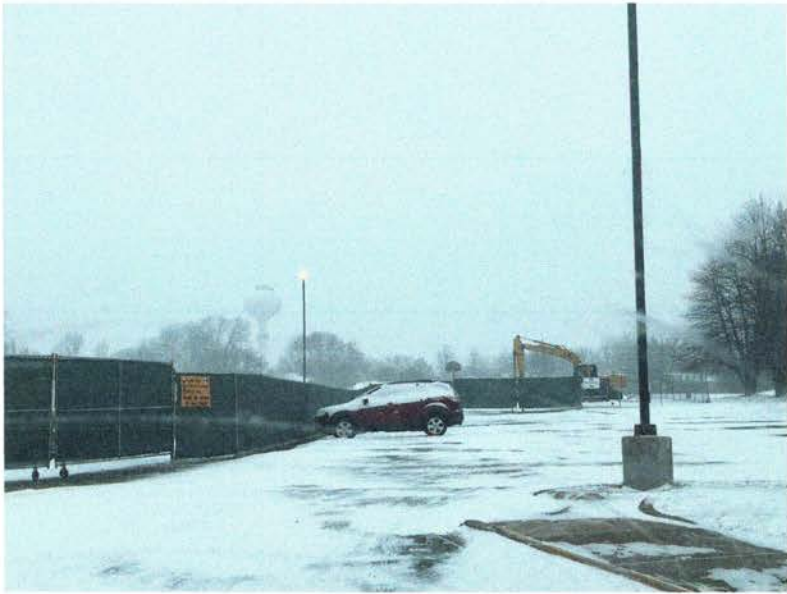
12/22/2022 After Snow