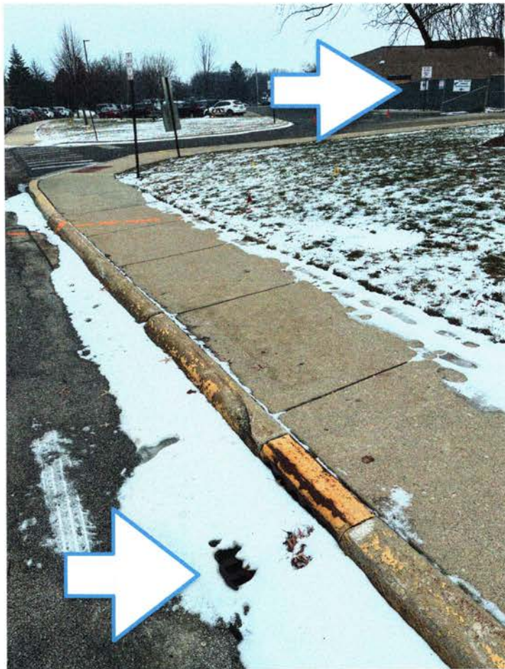
12/22/2022 Receiving inlet relative to site